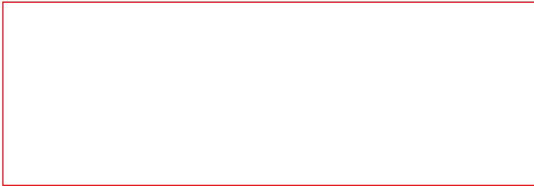
RIGHT HALF WALL (PRINTED INSIDE)